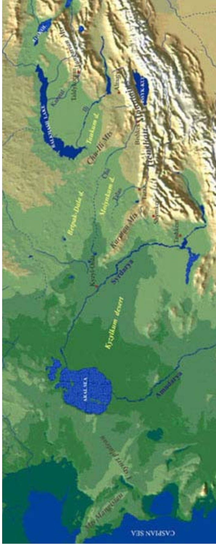
Fig 3.1 - Map of South Kazakhstan, from the Aral sea in the west to the Alakol lake in the east