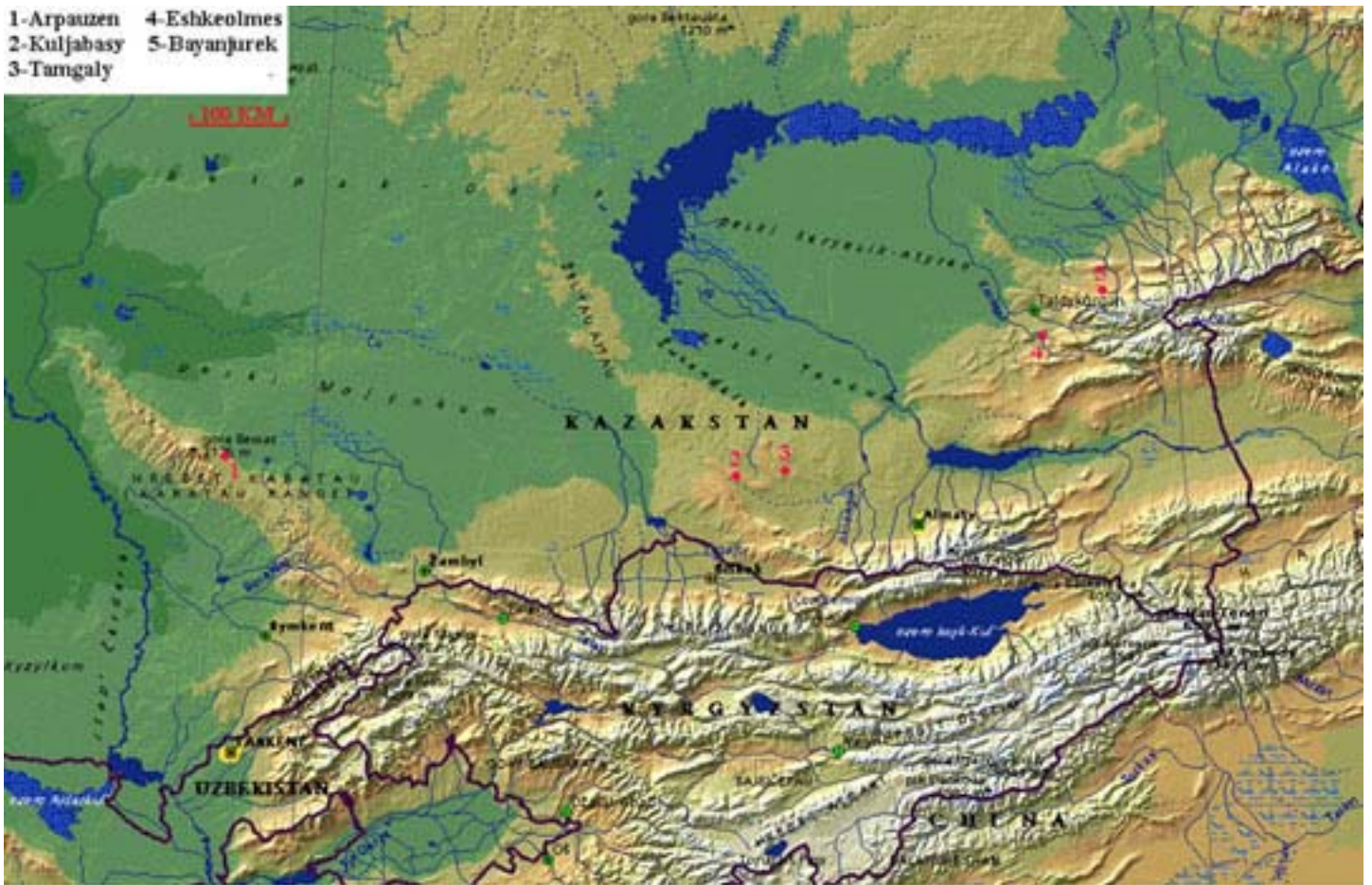
Fig 1 – General map of Chu-Ili mountains showing location of petroglyph sites