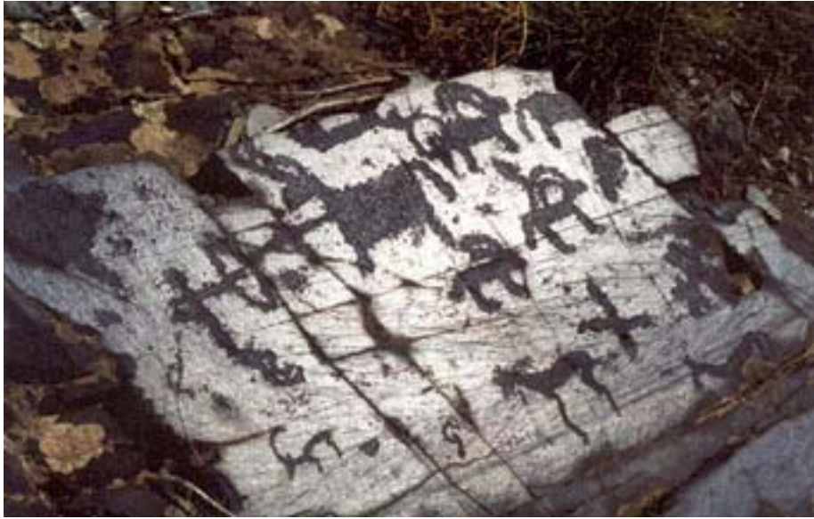
Fig 11 –Late Bronze period archer with animals, V5G2