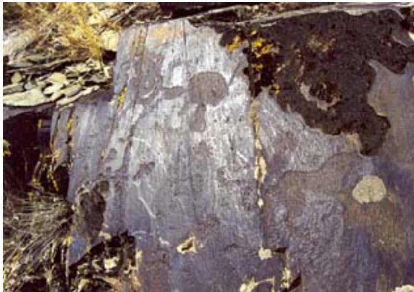
Fig 12 – Early Iron Saka period mirror, V5G1