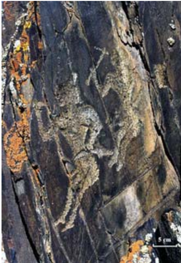
Fig 13 – Early Iron Saka period warriors, V5G1