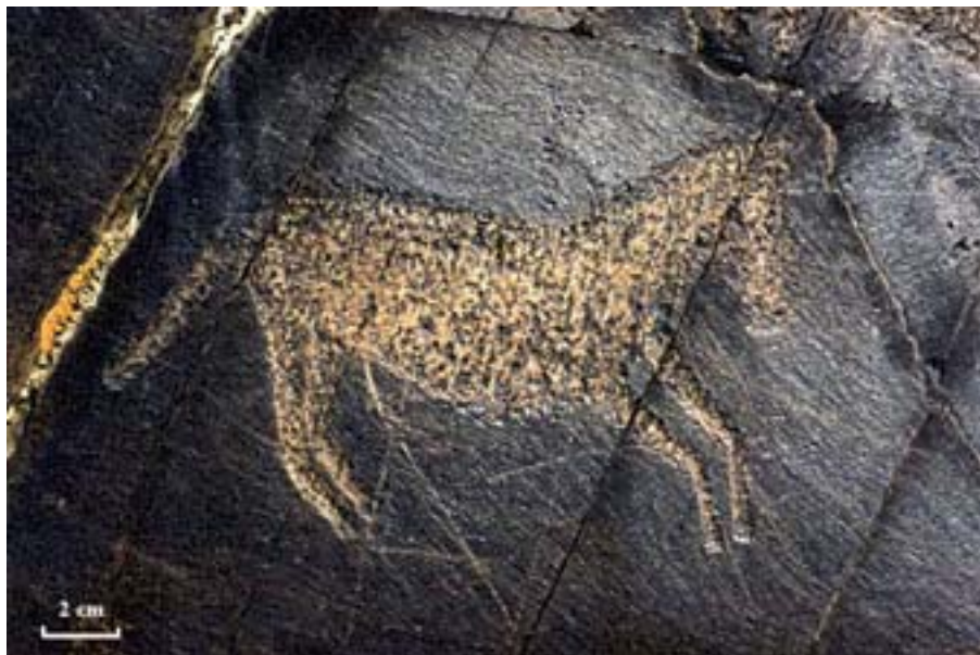
Fig 6 – Mid-Bronze period horse, V3G3