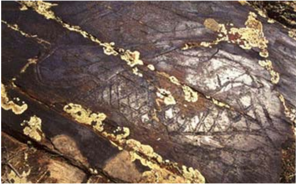
Fig 5 – Archaic period bull, V3G3-40, Plastic-striated