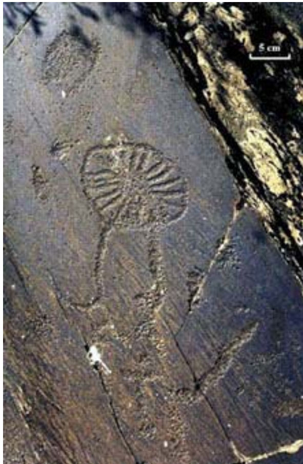
Fig 9 – Mid-Bronze period anthropomorphic sun figure and snake, V2G2