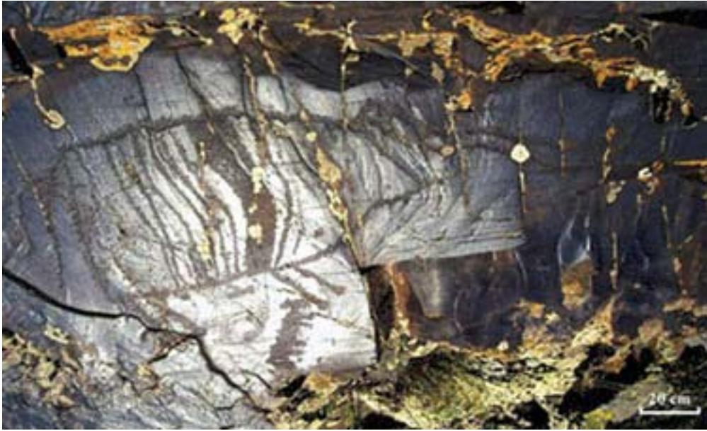
Fig 4 – Archaic period bull, V4G4, Schematic style