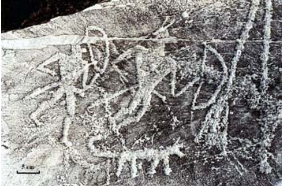
Fig 7 – Mid-Bronze period men with wolf masks, V3G3