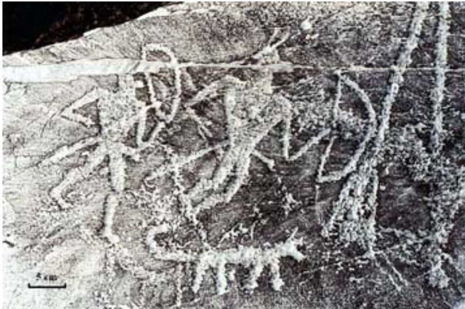
Fig 7 – Mid-Bronze period men with wolf masks, V3G3