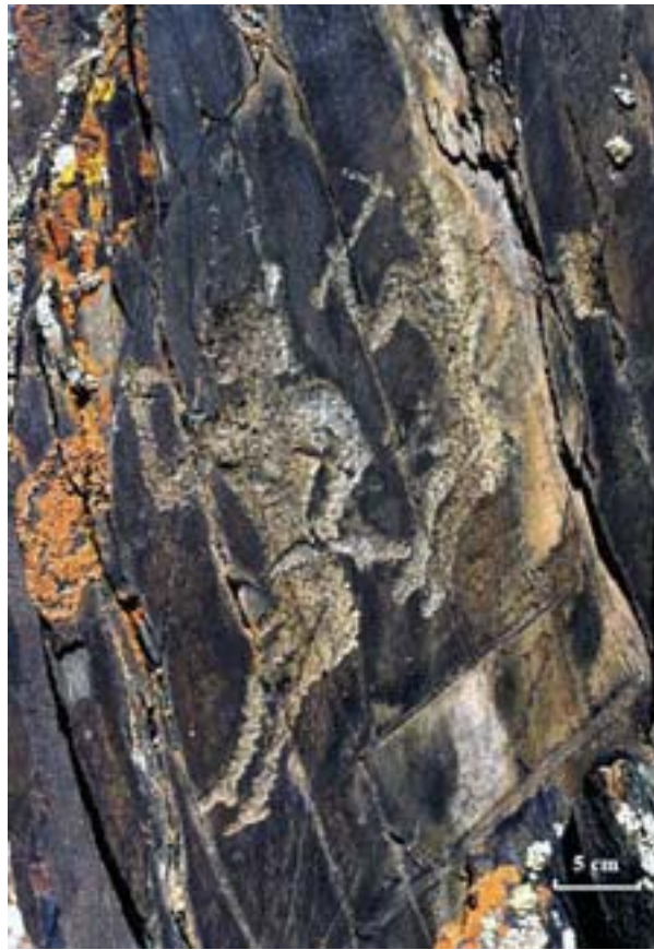
Fig 13 – Early Iron Saka period warriors, V5G1