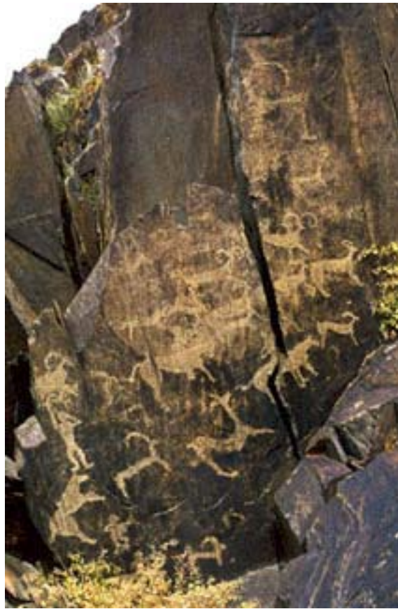
Fig 14 – Turkic animals, V3G4b