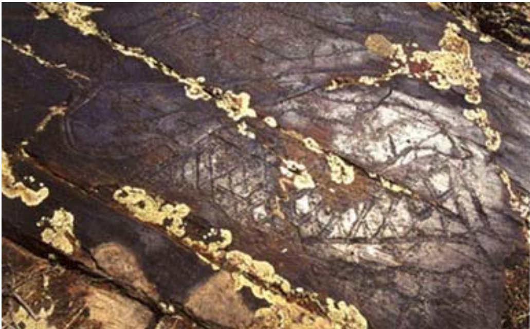
Fig 5 – Archaic period bull, V3G3-40, Plastic-striped