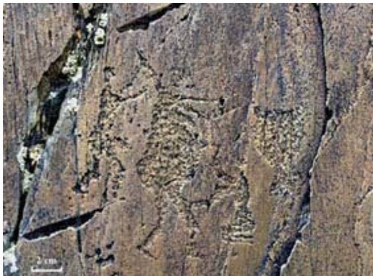
Fig 14 – Early Iron Saka period scene of motherhood, V5G1