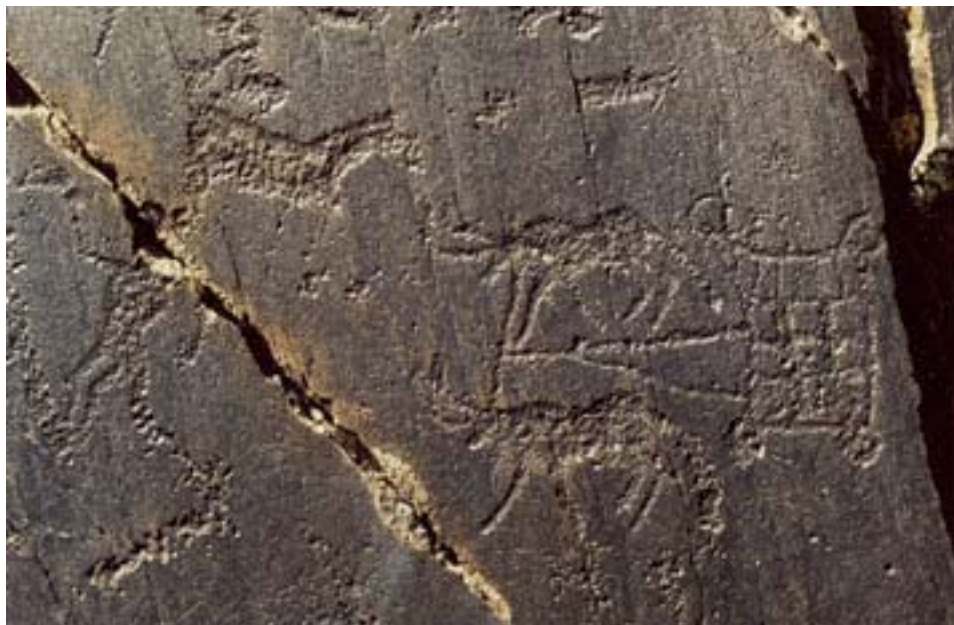
Fig 8 – Mid-Bronze period chariot, V3G3d