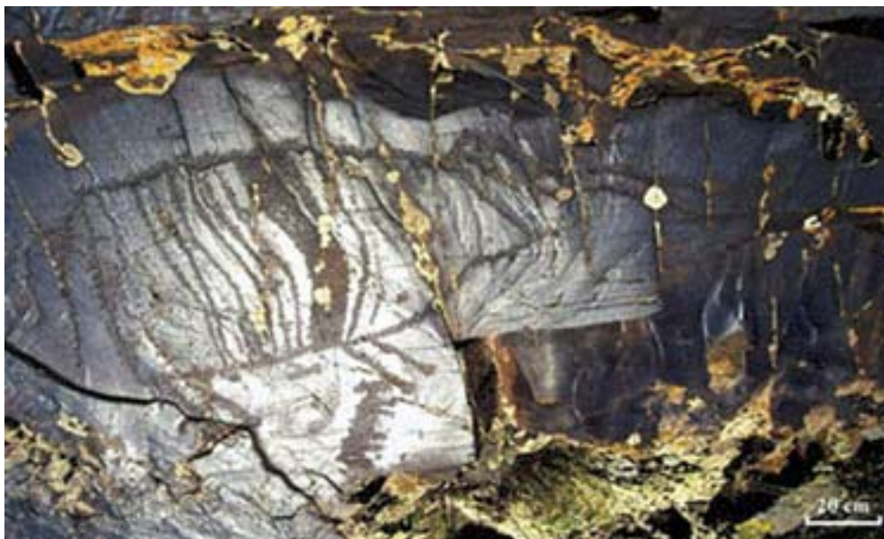
Fig 4 – Archaic period bull, V4G4, Schematic style