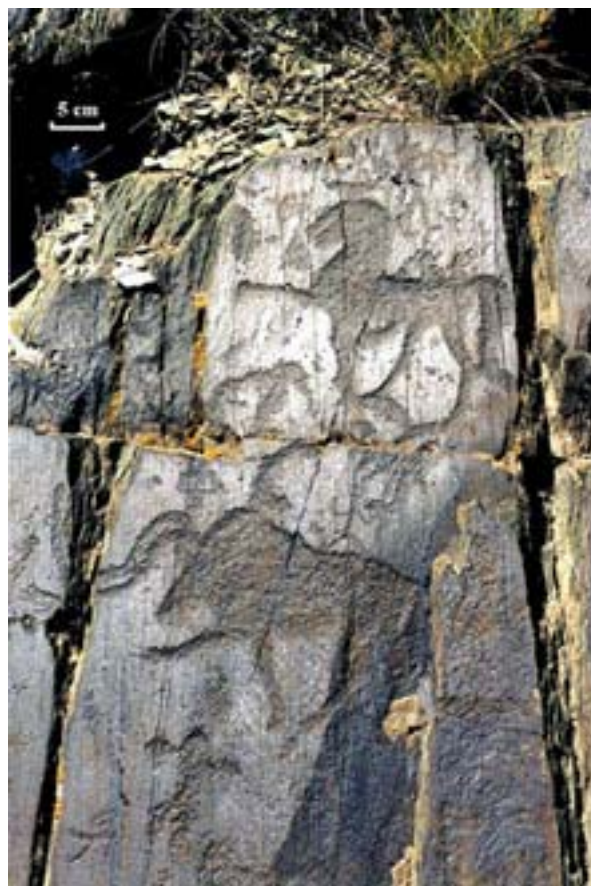
Fig 10 – Mid-Late Bronze period horse and bull, V14G2