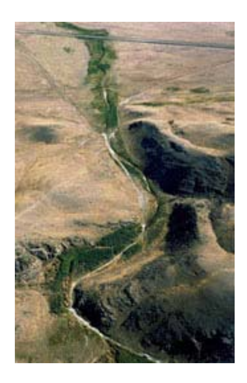
Fig 2 – Aerial view of the gorge of Tamgaly, with river Tamgaly active