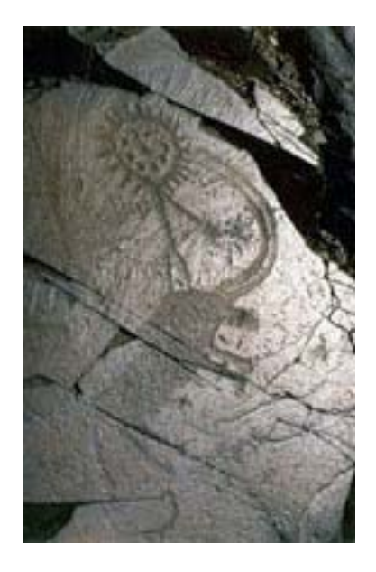
Fig 6 – Middle Bronze Age anthropomorphic solar deity standing on a bull (group III)