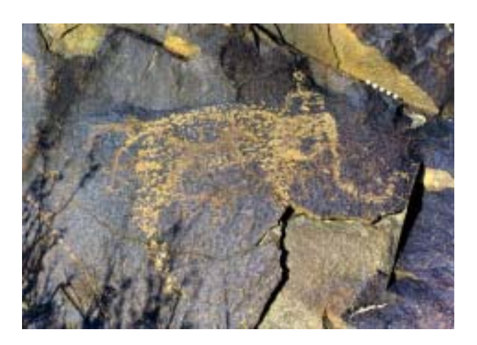
Fig 11 – Turkic elephant with rider