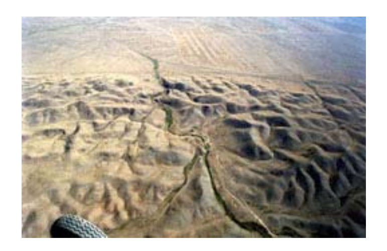
Fig 1 – Aerial view of the gorge of Tamgaly, showing the low-hill relief