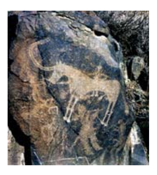
Fig\ 10-Bronze\ Age\ bull\ changed\ into\ the\ figure\ of\ a\ rider-warrior\ in\ the\ Medieval\ period\ (group\ III,\ surface\ 23)