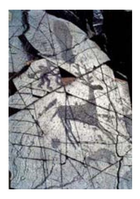
Fig 7 – Middle Bronze Age archer with a wolf mask