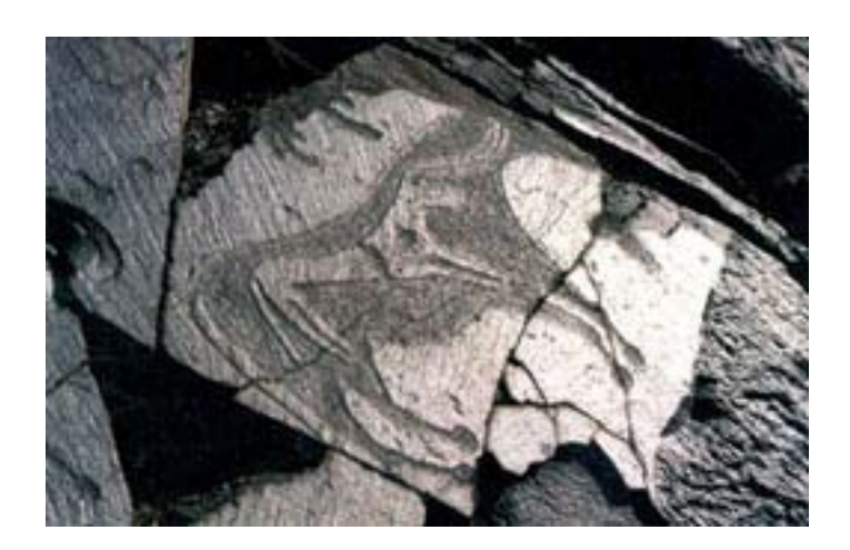
Fig 5 – Middle Bronze Age calf in high-relief depicted inside a cow executed in low-relief (group III)