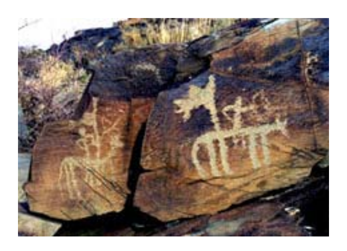
Fig\ 9-Turkic\ warrior-standard\ bearers