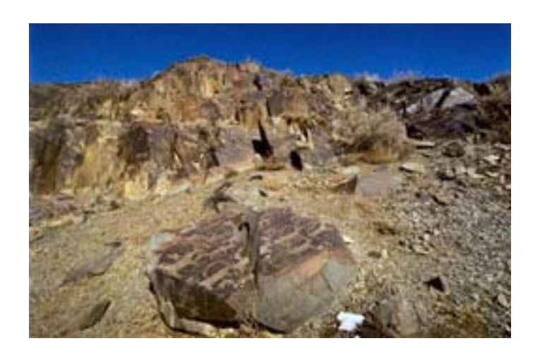
Fig 4 – Middle Bronze Age 'Tamgaly type' goats